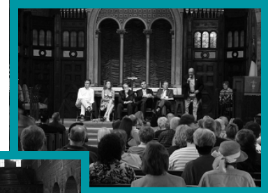
Haynesville Shale Meeting